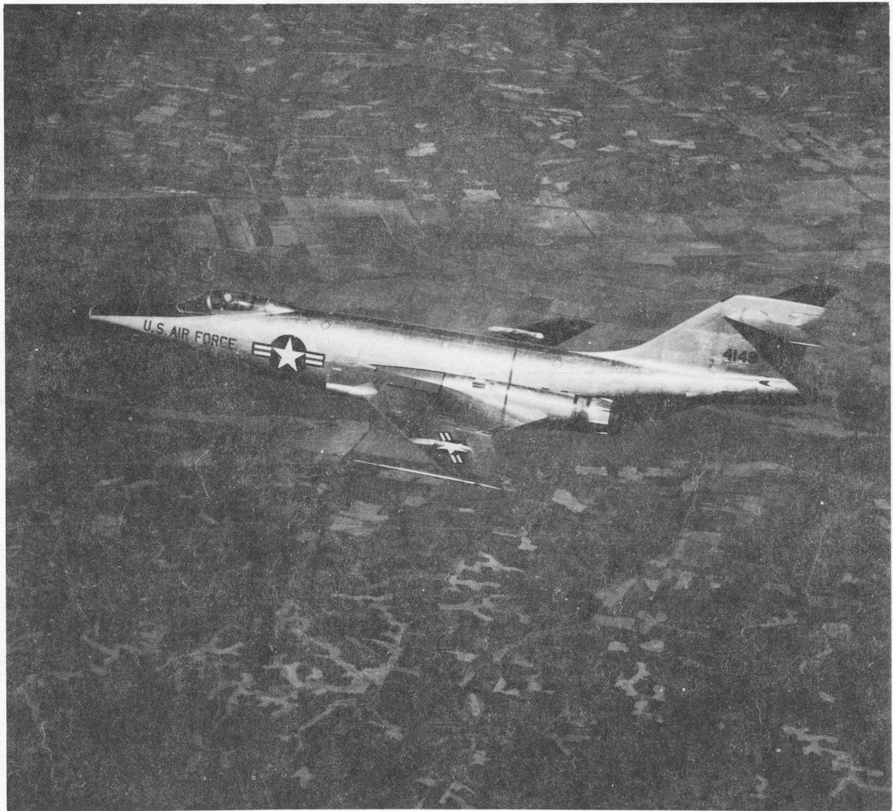
THE RF-101 IS A SUPERSONIC TACTICAL RECONNAISSANCE FIGHTER built by McDonnell. It is in wide usage throughout the Tactical Air Command.